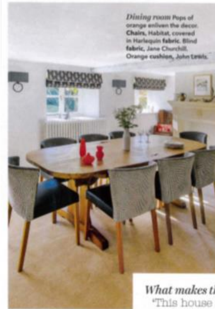
Dining room Pops of orange enliven the decor. Chairs, Habitat. covered in Harlequin fabric. Blind fabric, Jane Churchill. Orange cushions, John Lewis.