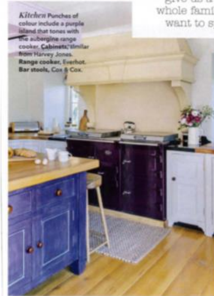
Kitchen Pops of colour include a purple island that tones with the aubergine range cooker. Cabinets, similar from Harvey Jones. Range cooker, Everhot. Bar stools, Cox & Cox.

Living room Vibrant cushions and throws introduce shots of colour into the neutral scheme. Corner sofa, Sofas & Stuff. Throws, Shrutti. Round cushions, Raine & Humble. Rug, John Lewis. Side tables, Made. Table lamp, Graham & Green. Blind fabric, Harlequin.